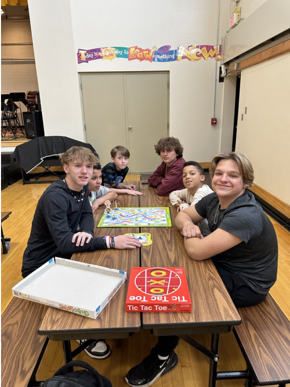
(SVHS Mentors with their Donnelly 2 nd & 3 rd graders).

Stay tuned for upcoming events, including end-of-year celebrations, academic recognitions, and more. May 15th will be decision day for our seniors going to college, joining the workforce, or joining the military, and kicks off the first of many senior events! This surely is a busy time of year. Your involvement and engagement are crucial in creating a thriving learning community, and we appreciate your ongoing support.